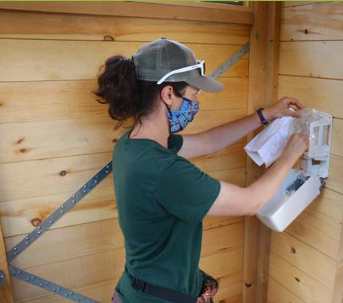
Camp Plymouth State Park